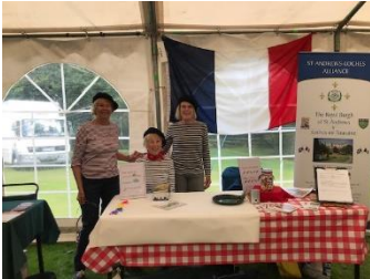
Charity Fair – L'Equipe

It was with exactly this in mind that we were present at the Craigtoun Charity Fair last weekend. This was a major attempt to raise the profile of the Alliance and as such I think it was very successful. Our stand was eye catching as you can see and the ingenious games for the children attracted lots of participants who left with a 'Loches' pencil or French sticker and ...a frog! Many thanks to everyone who made this such a great occasion.