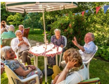
Members enjoying lunch in the sunshine

We were less successful in selling tickets for our BBQ and Jazz on the 14 th of July and sadly had to cancel as we could not cover our overheads. We decided instead to hold a lunch for those who had signed up. About 25 members came along to our garden, the sun shone, we were able to eat outside and linger long into the afternoon with a glass or two. The Fête Nationale was duly celebrated!